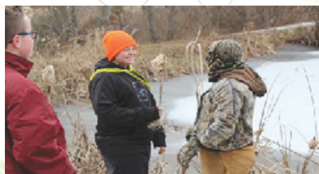
Students and Staff and thrilled to have the chance to take classes to the farm. Hands-on learning is a great way to learn.